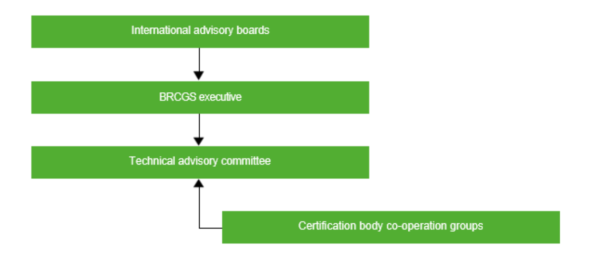
Figure 4 Technical governance structure for management of the Standard